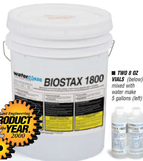
■ TWO 8 OZ VIALS (below) mixed with water make 5 gallons (left)

Important: BioStax 1800 must be kept refrigerated prior to use.