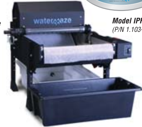
Model IPF2-20D (P/N 1.103-488.0)