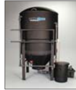
■ CL-30 Pre-Treatment Solids Separator

NOTE: We are constantly improving and updating our products. Consequently, pictures, features and specifications in this brochure may differ slightly from current models. Water Maze is not responsible for procurement of regulatory, operation and/or discharge permits that may be required by city, county, state or federal agencies for particular uses of the Water Maze product line. The customer is responsible for procuring any hazardous or non-hazardous regulatory, operating and/or discharge permits for complying with codes or other governmental requirements associated with the installation, use, or disposal of waste associated with the Water Maze product line.