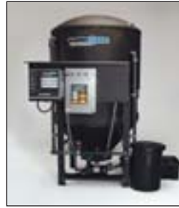
■ CL-600 Discharge System