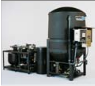
■ CL-603 with Filter Pac III Recycle System

Flow Rates of up to 30 GPM | Compact Footprint | Self-Contained Yet Modular Flexibility | Above Ground Design