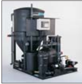
■ CL-304 Extra-Compact Recycle System