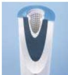
Hurricane A/C cartridge

*Results may vary and are based on flow and other factors. ** Approx.