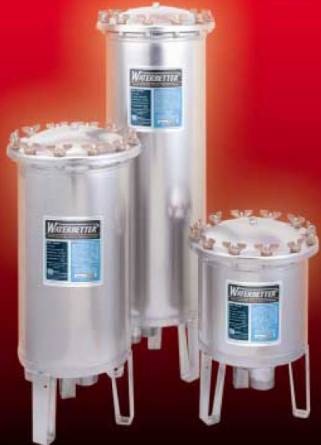
Single cartridge housings for genuine Harmsco® Hurricane Cartridges.