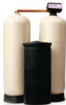
600,000 grain fiberglass twin alternating system

Ecodyne Twin Alternator systems are designed for applications requiring a continuous flow of soft water up to 40 GPM and peak flows up to 54 GPM. The volume initiated demand softeners combine our advanced VIP electronic controls with the cost-effective Fleck® twin valve. The system keeps one tank in service while either regenerating or holding the other tank in standby.