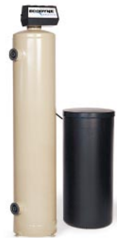
90,000 grain Polybond® tank with 1" valve

Ecodyne manufactures its own fiberglass tanks in diameters through 24". This enables us to control both quality and manufacturing cost so we can produce superior tanks at very competitive prices. (Ecodyne's fiberglass tanks in sizes 30" in diameter and larger are made by outside manufacturers to our strict specifications.)