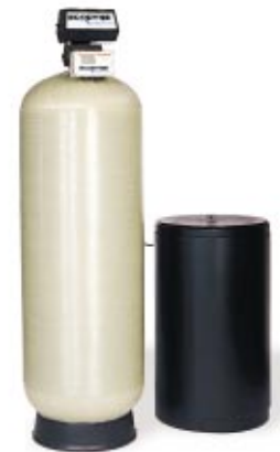
300,000 grain fiberglass system with 2" valve and VIP I control