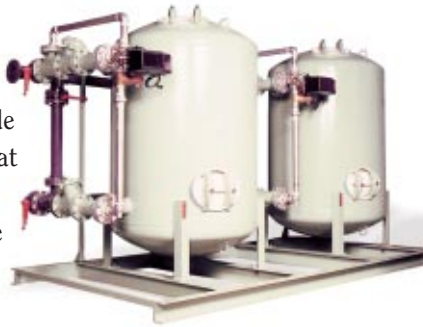
Softener with Skid Mounted (option)

Tanks feature industrial-grade steel. All interior surfaces that contact water are lined with an NSF approved, food-grade epoxy lining that meets FDA leachability requirements. Brine tanks are standard equipment and bulk storage systems are available as an option. Two 12" x 16" manways (1 in top head, 1 in lower sideshell) provide access to the rust-proof and corrosion-resistant PVC internal distribution system.