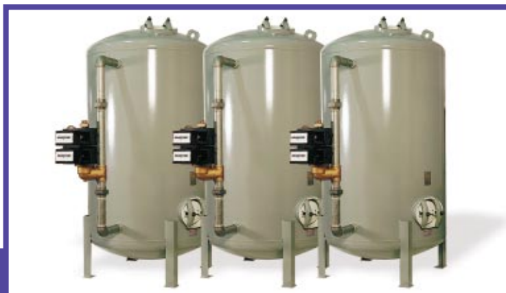
Triplex Softening system 8,100,000 grain capacity with variable flow control 100 psi ASME (option)