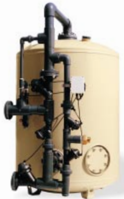
1,200,000 grain Polybond® tank with PVC valve nest

Ecodyne's Valve Nest systems provide outstanding performance and the added flexibility that multiport valves can't offer. They are ideal for most heavy-duty industrial softening applications with high flowrates at low pressure drops, corrosive water, high-temperature (condensate) and/or high-pressure softening, or with water-reuse/reconditioning requirements.