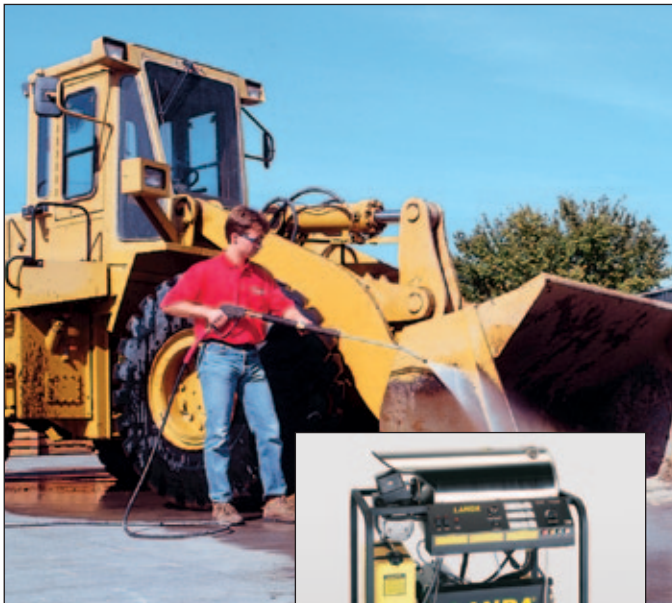
The SEHW is a top-of-the-line model for hot water pressure washing outdoors