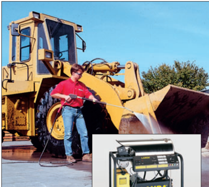
The SEHW is a top-of-the-line model for hot water pressure washing outdoors