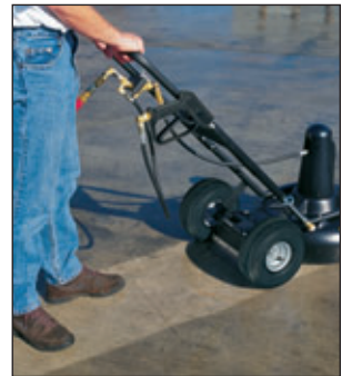
The Water Jet attaches to a hot or cold water pressure washer and cleans flat surfaces fast using a water-propelled spray bar that spins at 2000 RPM