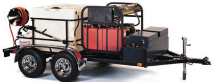
TR-6000 double-axle trailer shown with optional pressure washer, fuel and tool box, work lamp, chrome fenders and wheels

Landa has two trailer-mounted wash systems for on-site cleaning, a single-axle trailer with 200 gal. water tank and a double-axle model with a 330 gal. tank. These top-quality packages allow you to customize the trailer to your needs by mixing and matching trailer beds, pressure washers and a wide selection of options and accessories.