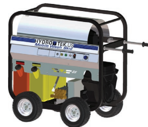
Wheel kit options available

Hour meter, Soap injection kit, Winterizing kit, Custom skid color, Turbo nozzle, Hydro Twister-concrete cleaner, Wet sandblast assembly, Hose and wand extensions, Wheel kits, Stainless hose reels, Machine covers, trailers and tank skids, 12v AGM sealed battery