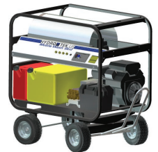
Wheel kit options available

Hydro Vacuum Wastewater Recovery: The SC Series generator will power the Hydro Vacuum AZV system to capture, filter and recycle used wash water, saving time, money and the environment. (12v models without generator not compatible)