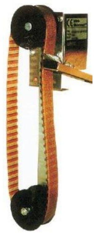
Photo shows polyurethane belt and fixed tail pulley design.

Special skimmers with other options such as special belt lengths (to 20 ft.), two belts, or stainless motor covers are available.