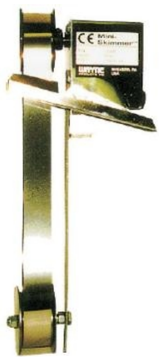
Photo shows stainless steel belt and fixed tail pulley design.

Mini-Skimmers™ have been in use throughout the world since 1980. Thousands are used daily to remove unwanted floating or "tramp" oils.