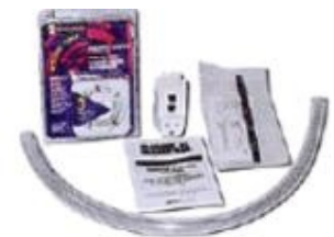
Timer, Ground Fault Interrupter, Handle Kit and Outlet Extension Hose.