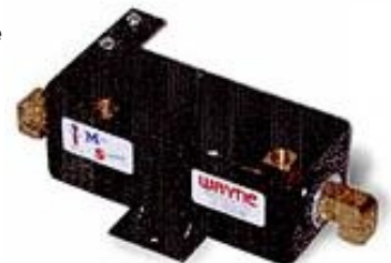
Gravity Oil/Water Separator