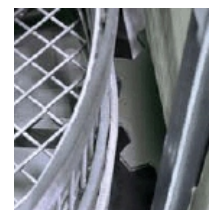
Sprocket Driven Turntable