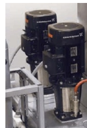
Vertical Sealless Pump