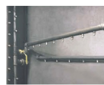
Swing Away Mid Level Spray Bar