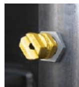
V-Jet Precision Nozzle