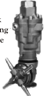
Tank Cleaning Nozzle