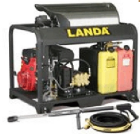
Hot Water Pressure Washer