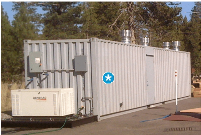
Level 3 Example - Portable